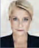
Trine Dyrholm (The Legacy)